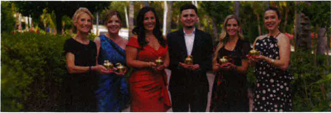
Champions For Learning – Golden Apple Celebration of Teachers 2026